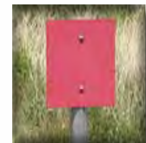
Red sign indicates private lands.