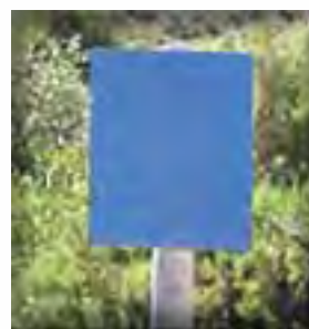
Blue sign indicates public access.